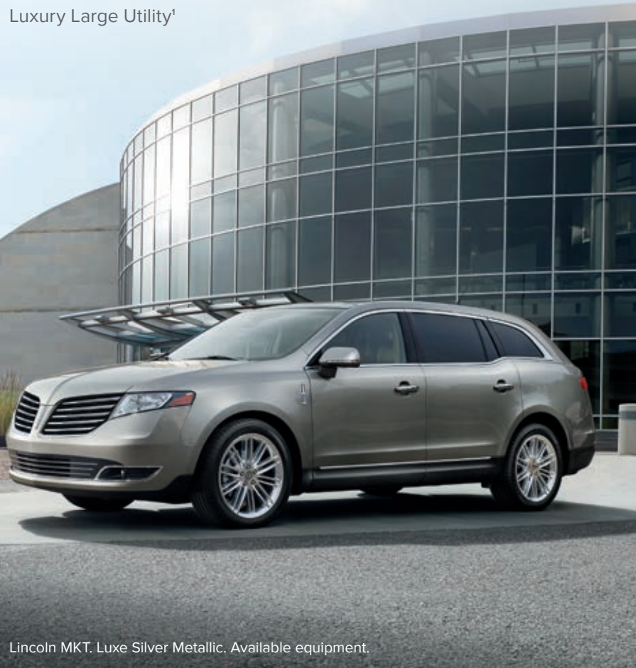
Lincoln MKT. Luxe Silver Metallic. Available equipment.