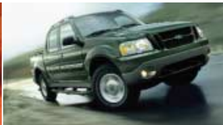
EXPLORER SPORT TRAC