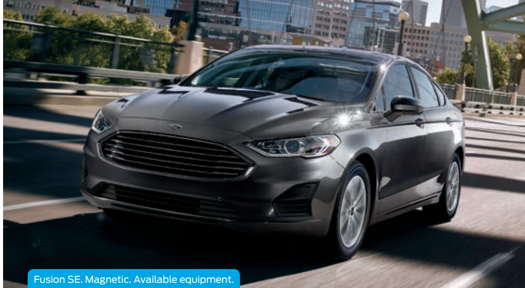
Fusion SE. Magnetic. Available equipment.