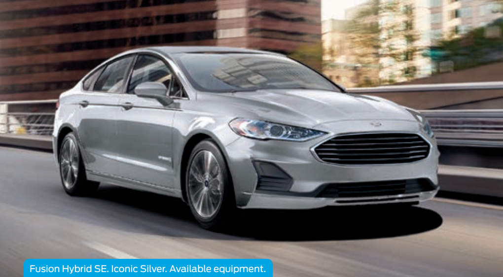
Fusion Hybrid SE. Iconic Silver. Available equipment.