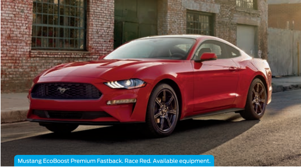
Mustang EcoBoost Premium Fastback. Race Red. Available equipment.

Models: EcoBoost, ® EcoBoost Premium, GT, GT Premium (Fastback); EcoBoost, EcoBoost Premium, GT Premium (Convertible)