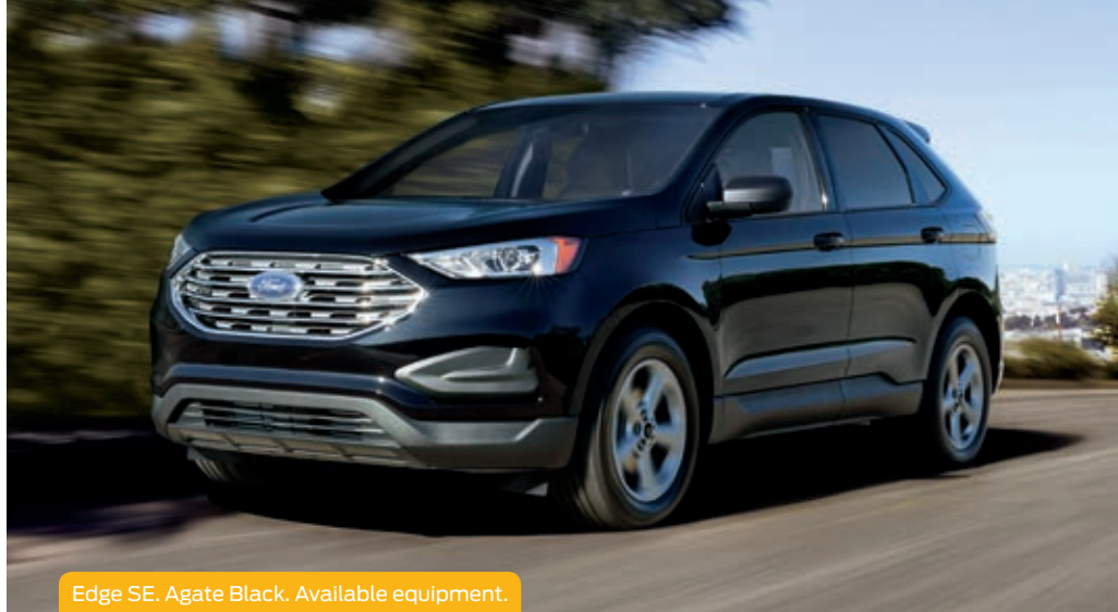
Edge SE. Agate Black. Available equipment.