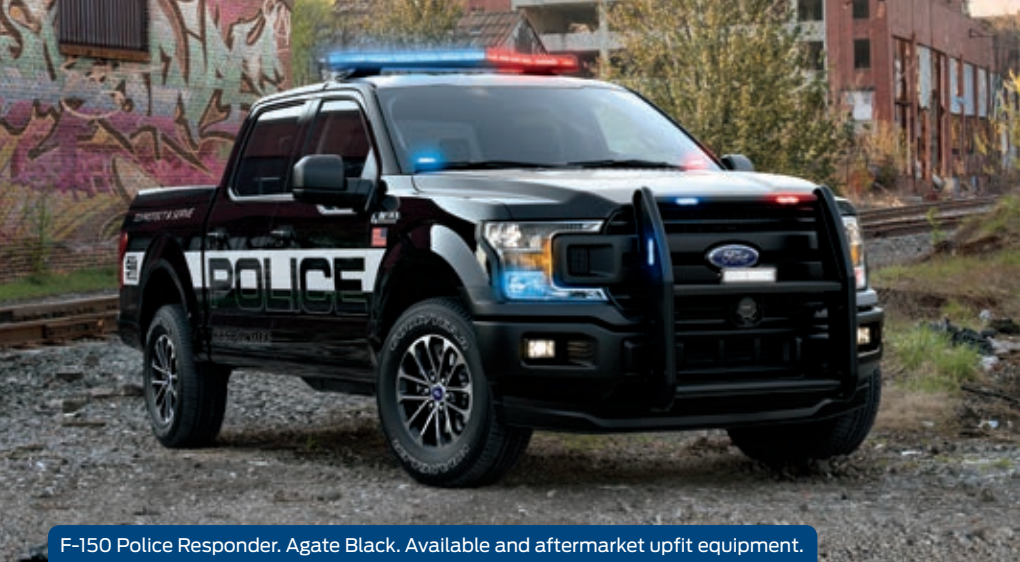
F-150 Police Responder. Agate Black. Available and aftermarket upfit equipment.