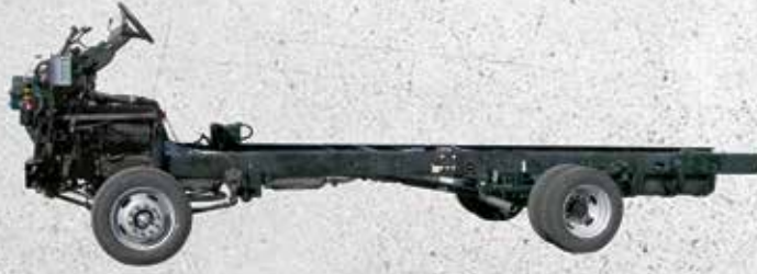
2019 model shown.