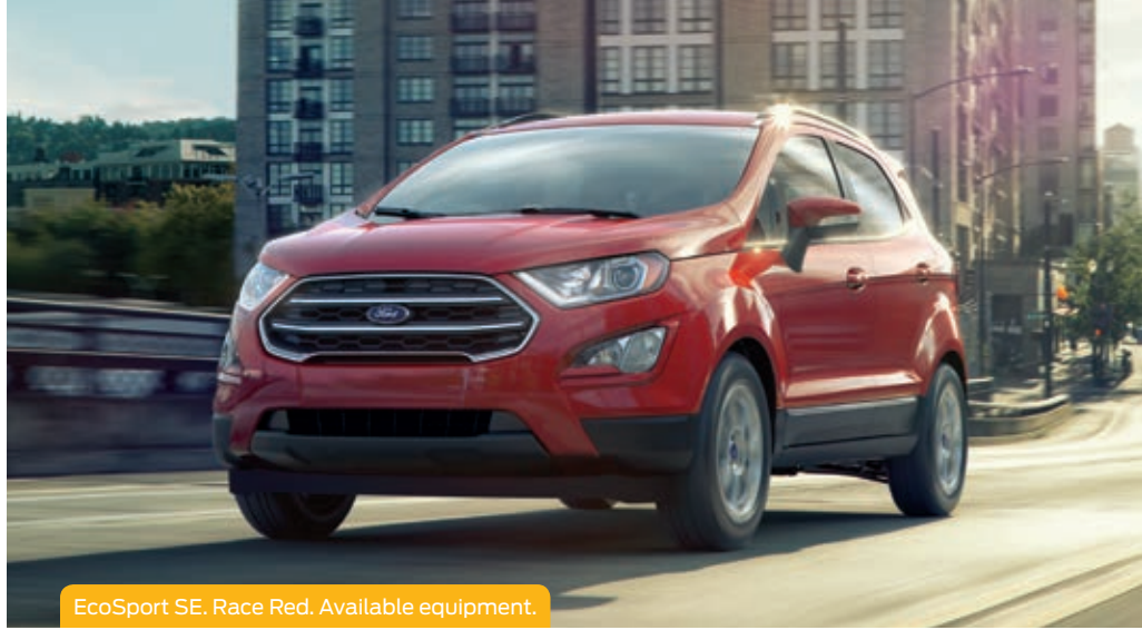
EcoSport SE. Race Red. Available equipment.