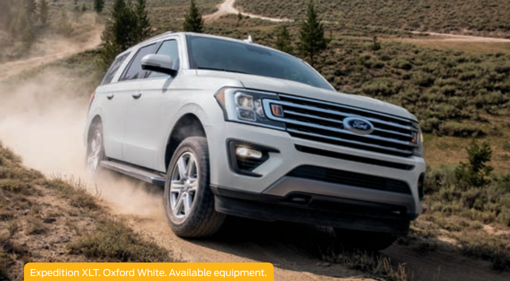
Expedition XLT. Oxford White. Available equipment.

Models: XL (Fleet Exclusive), XLT, Limited, Platinum