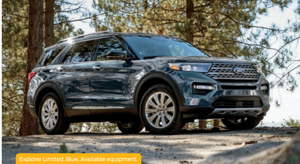
Explorer Limited. Blue. Available equipment.

Models: Explorer, XLT, Limited, ST, Platinum