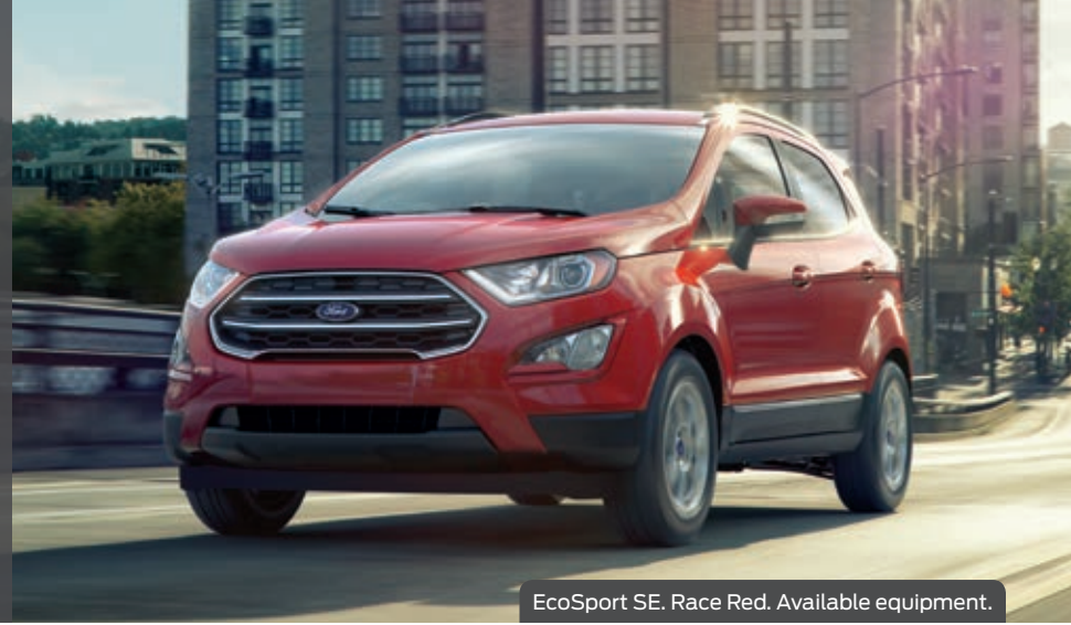
EcoSport SE, Race Red. Available equipment.

Mini Utilities Class 1 Models: S, SE, SES, Titanium