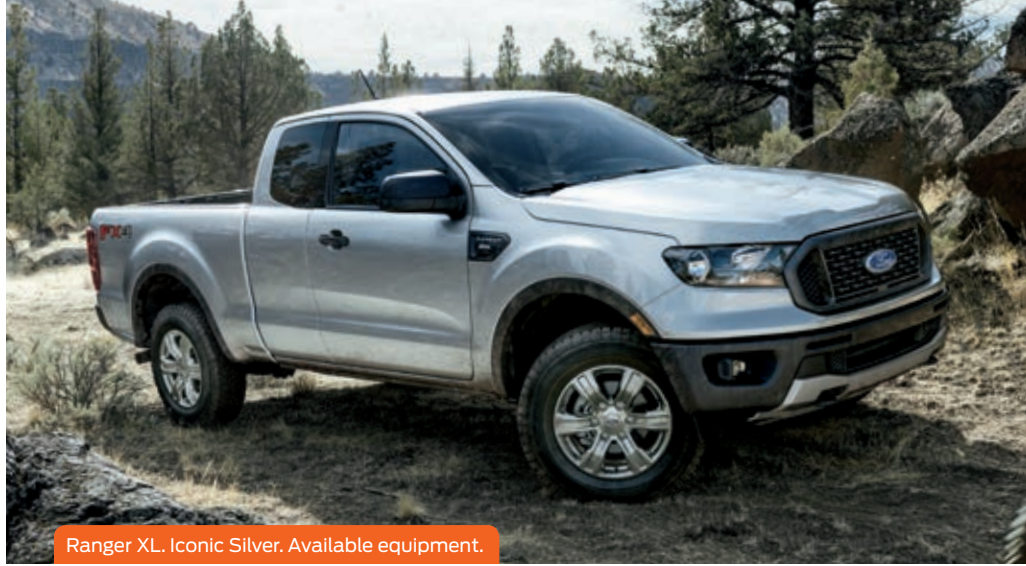
Ranger XL. Iconic Silver. Available equipment.