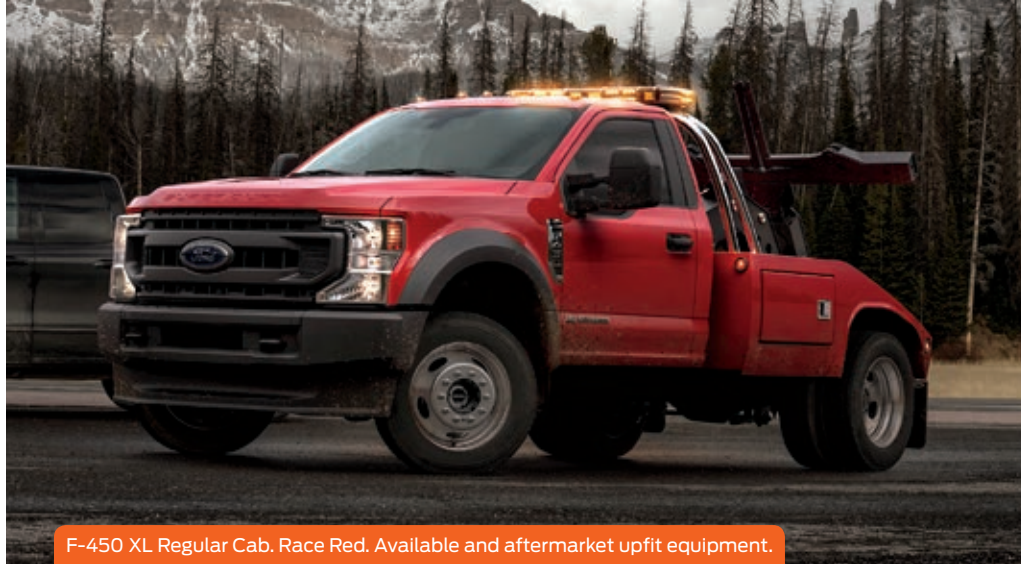
F-450 XL Regular Cab. Race Red. Available and aftermarket upfit equipment.