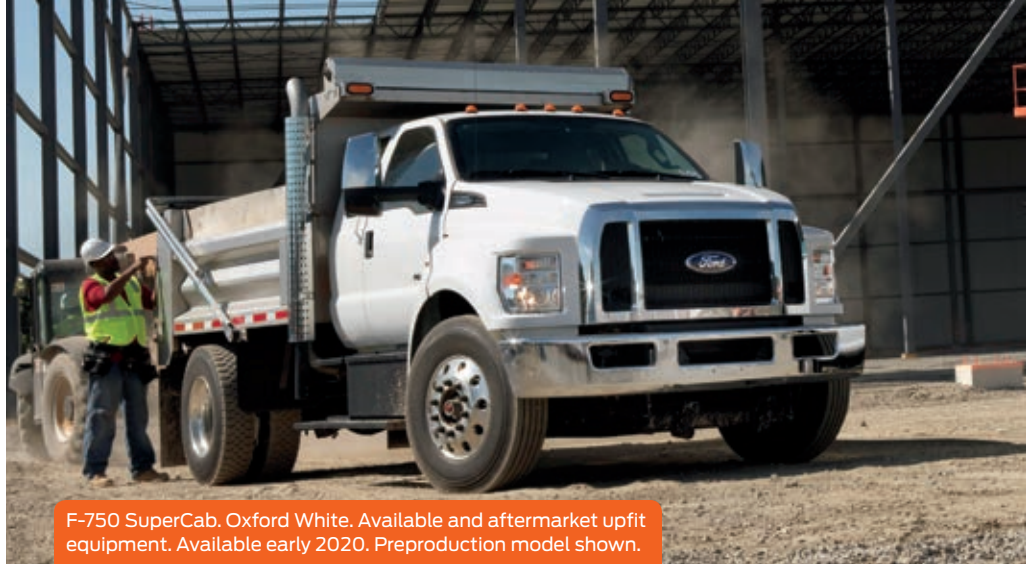
F-750 SuperCab, Oxford White. Available and aftermarket upfit equipment. Available early 2020. Preproduction model shown.