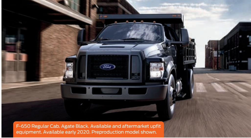
F-650 Regular Cab. Agate Black. Available and aftermarket upfit equipment. Available early 2020. Preproduction model shown.