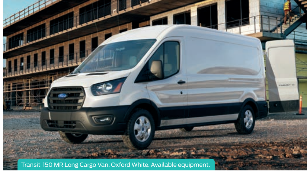
Transit-150 MR Long Cargo Van. Oxford White. Available equipment.

Models: Transit-150, Transit-250, Transit-350, Transit-350 HD