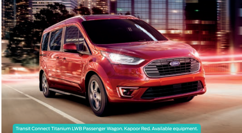
Transit Connect Titanium LWB Passenger Wagon. Kapoor Red. Available equipment.