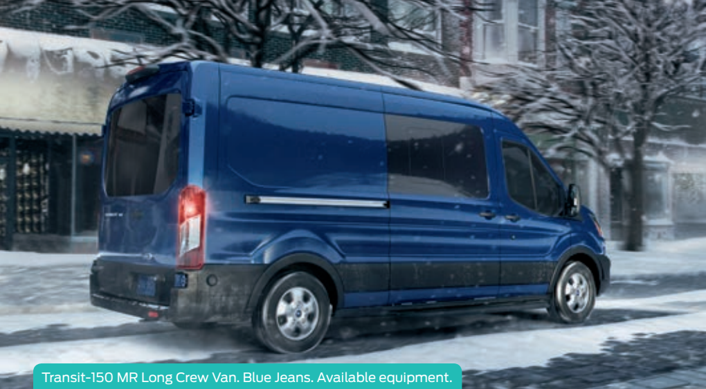
Transit-150 MR Long Crew Van. Blue Jeans. Available equipment.

Models: Transit-150, Transit-250, Transit-350, Transit-350 HD