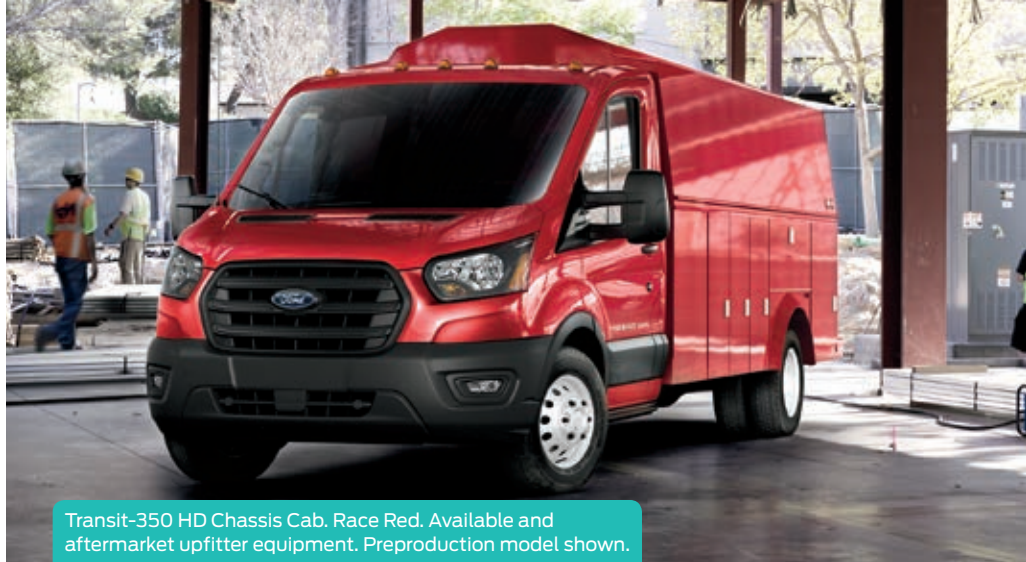
Transit-350 HD Chassis Cab. Race Red. Available and aftermarket upfitter equipment. Preproduction model shown.

Models: Transit-250, Transit-350, Transit-350 HD