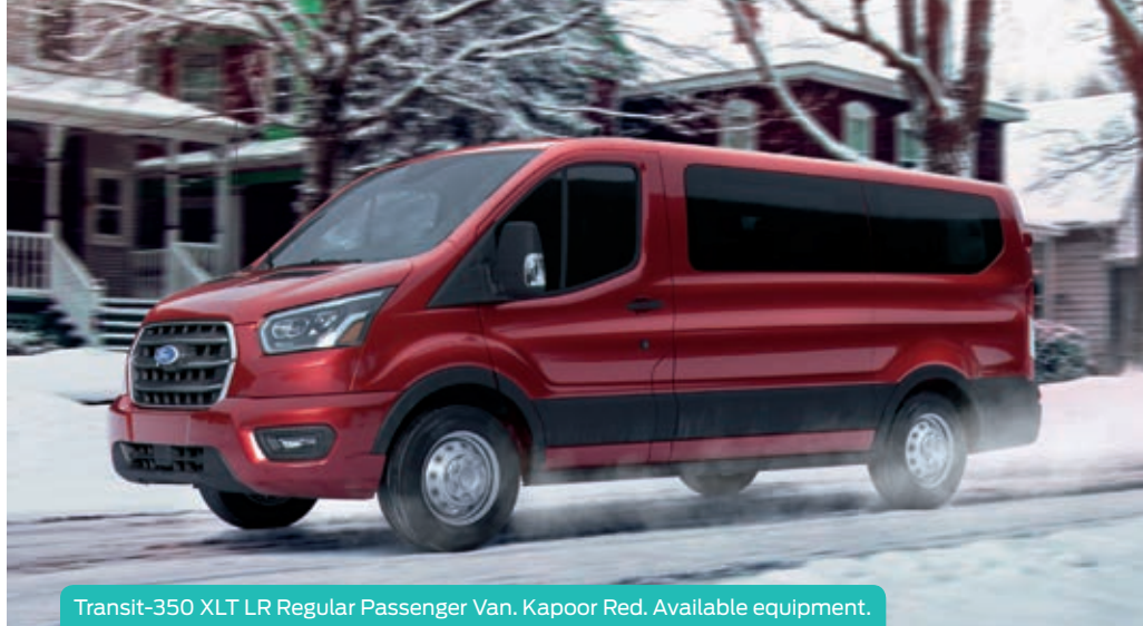
Transit-350 XLT LR Regular Passenger Van. Kapoor Red. Available equipment.

Models: Transit-150 XL, Transit-150 XLT, Transit-350 XL, Transit-350 XLT, Transit-350 HD XL, Transit-350 HD XLT