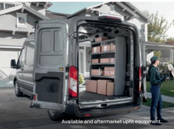
Available and aftermarket upfit equipment.