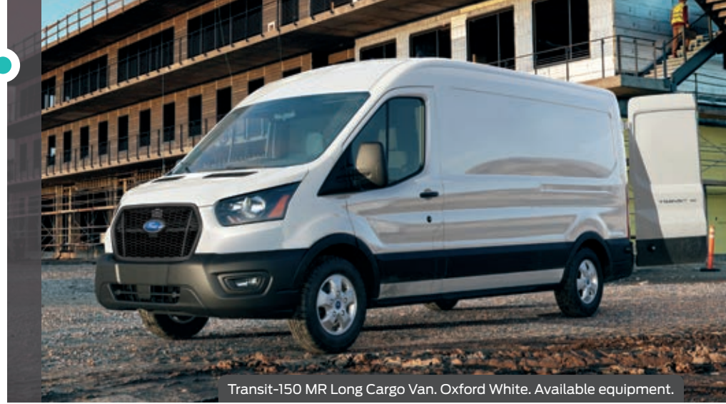
Transit-150 MR Long Cargo Van, Oxford White. Available equipment.

Models: Transit-150, Transit-250, Transit-350, Transit-350 HD