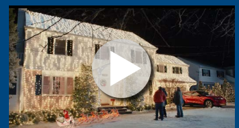
“Electri-Vacation” starring the Griswolds | Mustang Mach-E