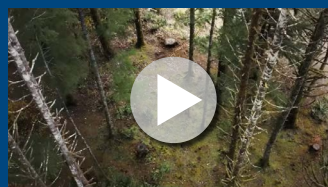
The All-New 2021 F-150: Cabin