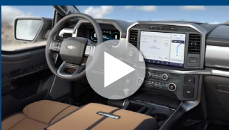
F-150: Over-the-Air Updates

CLICK HERE for more Ford videos. CLICK HERE for Lincoln videos.