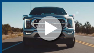
The 2021 Ford F-150: Walkaround