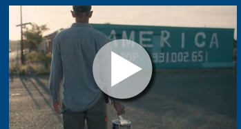
Builders: Built for America