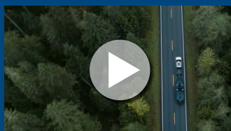
The All-New 2021 F-150: Brand New Tough