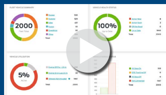
Ford Telematics: See It in Action