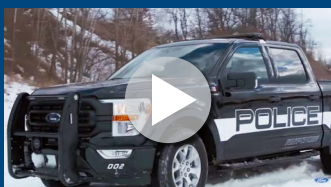
The All-New F-150® Police Responder®

CLICK HERE for more Ford videos. CLICK HERE for Lincoln videos.