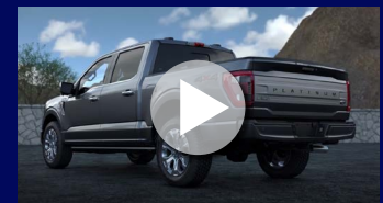
Ford F-150: Camera Views on Demand