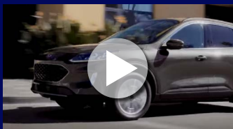
Pedestrian Alert System: Ford How-To

CLICK HERE for more Ford videos. CLICK HERE for Lincoln videos.