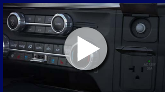
Pro Power Onboard: Ford How-To