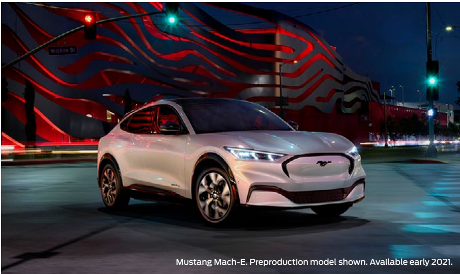
Mustang Mach-E. Preproduction model shown. Available early 2021.