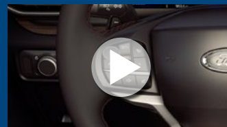
How to Use Intelligent Adaptive Cruise Control