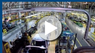
Ford Truck Plant Return-to- Work Timelapse