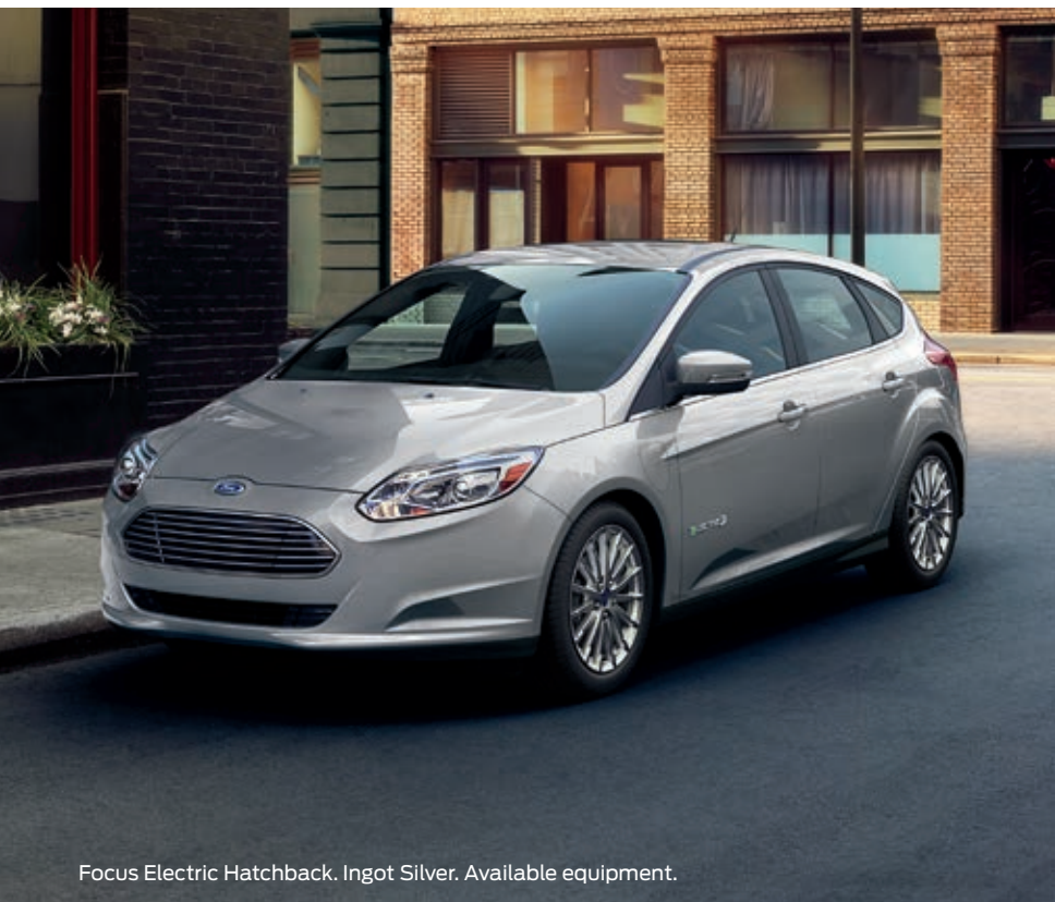
Focus Electric Hatchback. Ingot Silver. Available equipment.