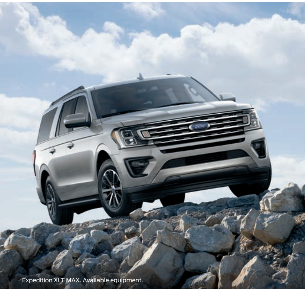
Expedition XLT MAX. Available equipment.