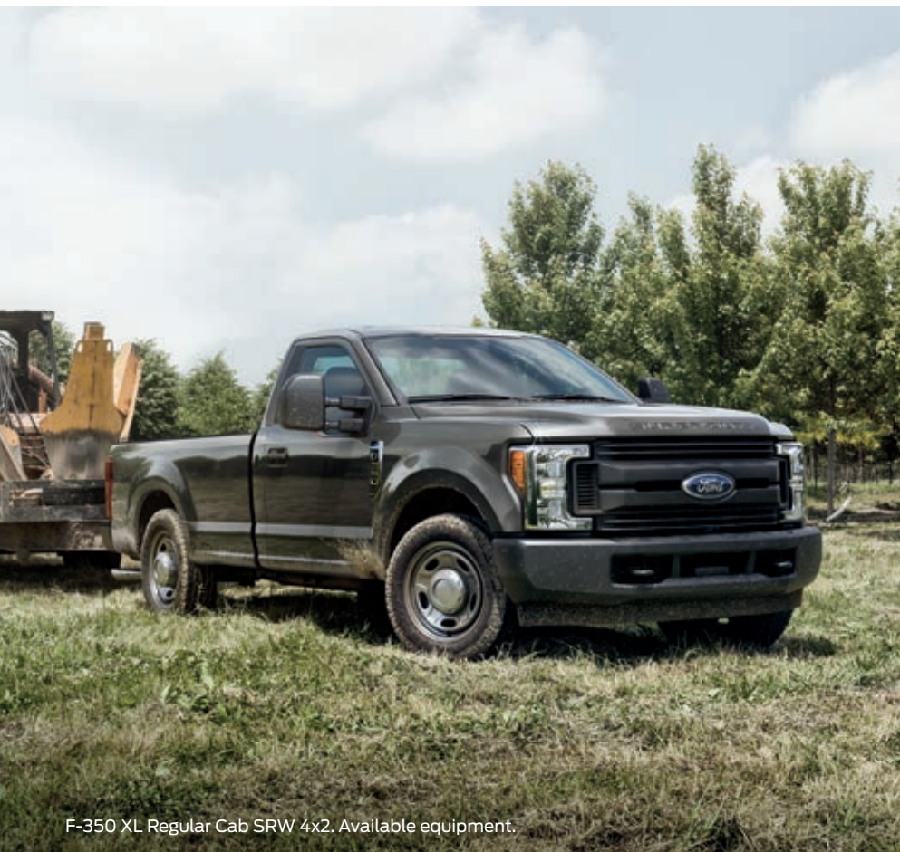
F-350 XL Regular Cab SRW 4x2. Available equipment.