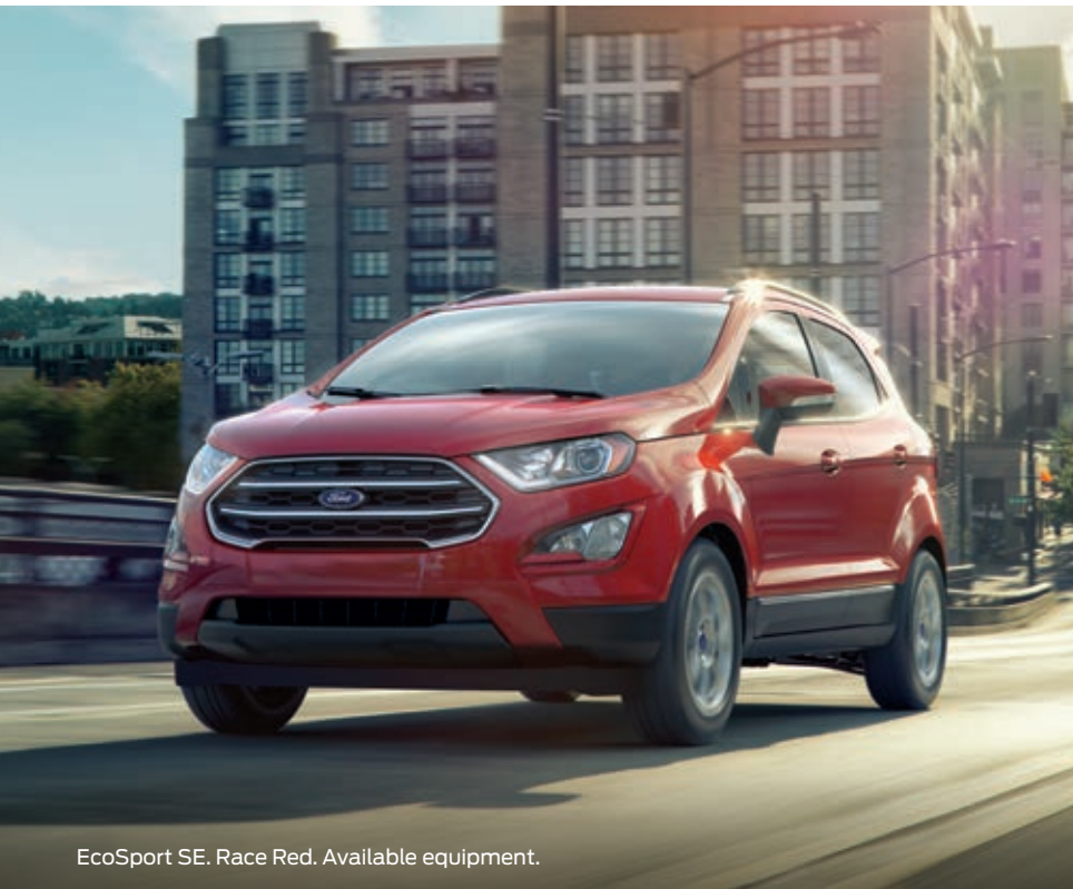
EcoSport SE. Race Red. Available equipment.

Mini Utilities Class 1 Models: S, SE, SES, Titanium