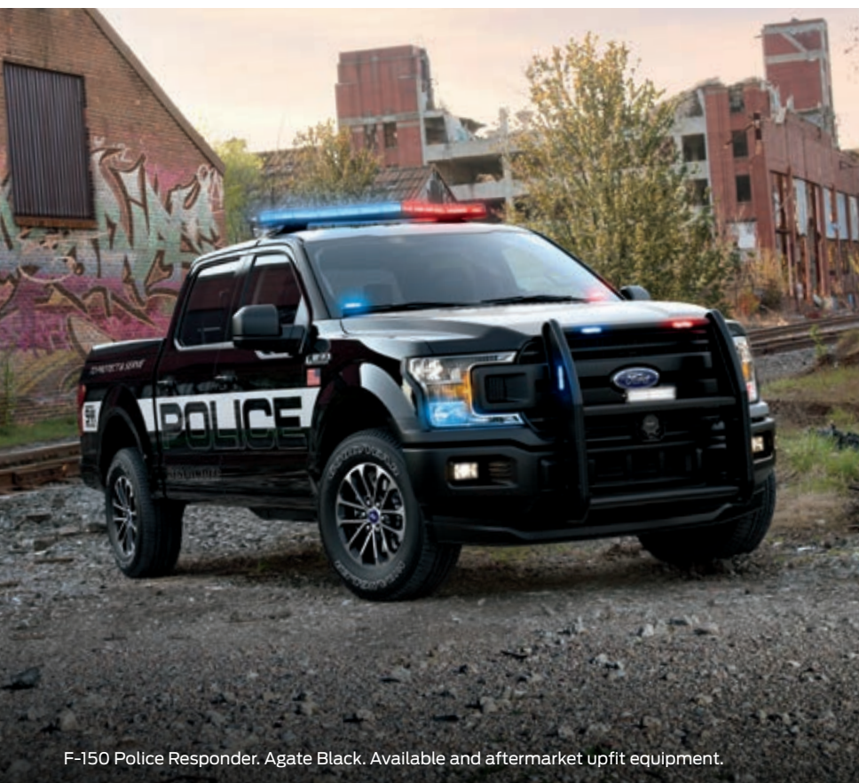
F-150 Police Responder. Agate Black. Available and aftermarket upfit equipment.