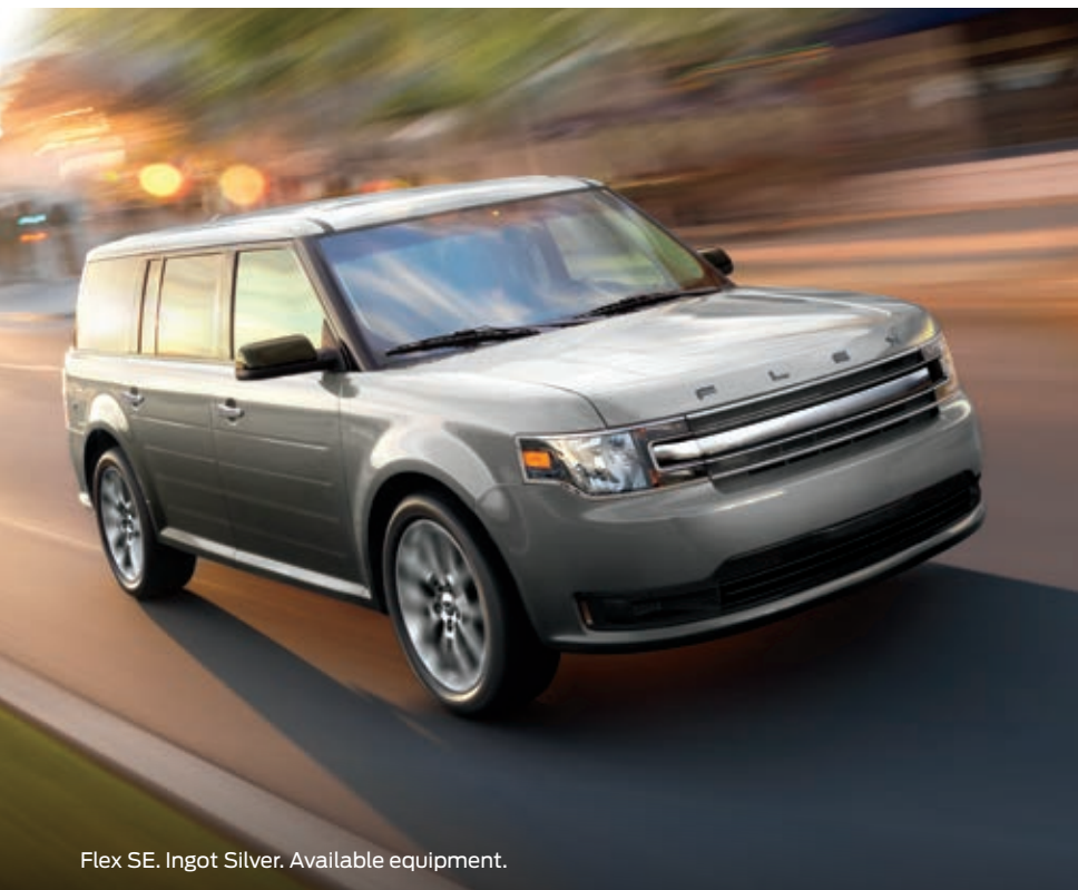
Flex SE. Ingot Silver. Available equipment.

Large Utilities Class 1 Models: SE, SEL, Limited