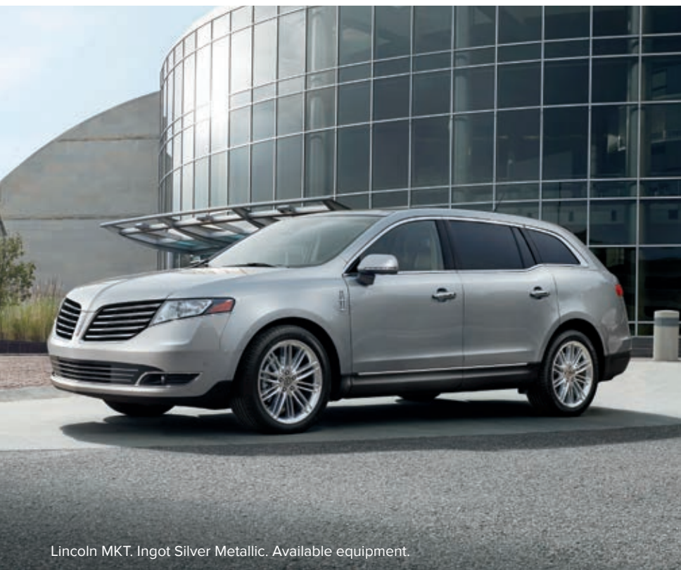
Lincoln MKT. Ingot Silver Metallic. Available equipment.