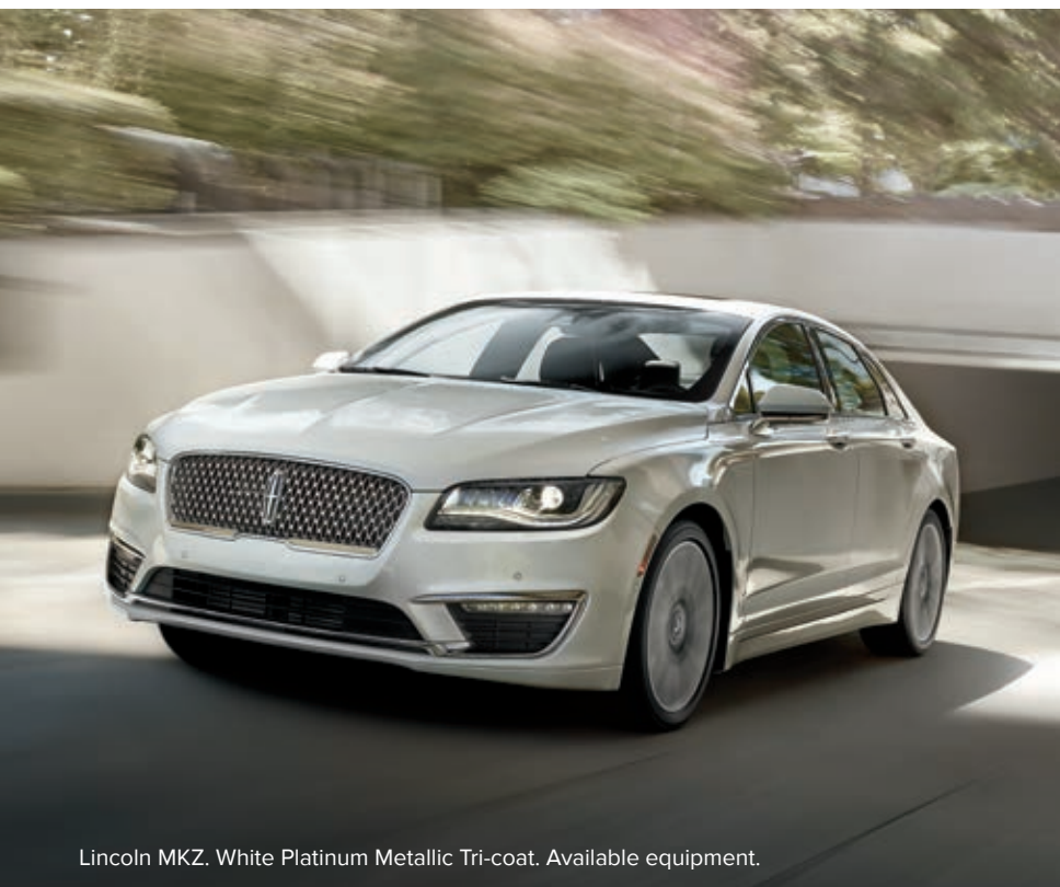
Lincoln MKZ. White Platinum Metallic Tri-coat. Available equipment.