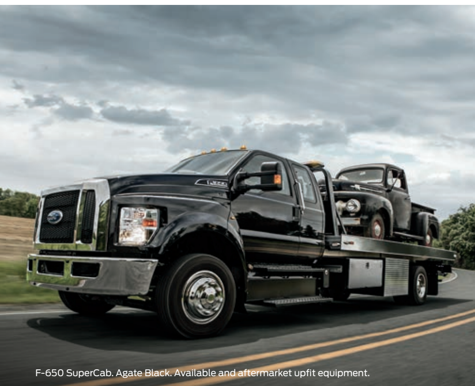
F-650 SuperCab. Agate Black. Available and aftermarket upfit equipment.