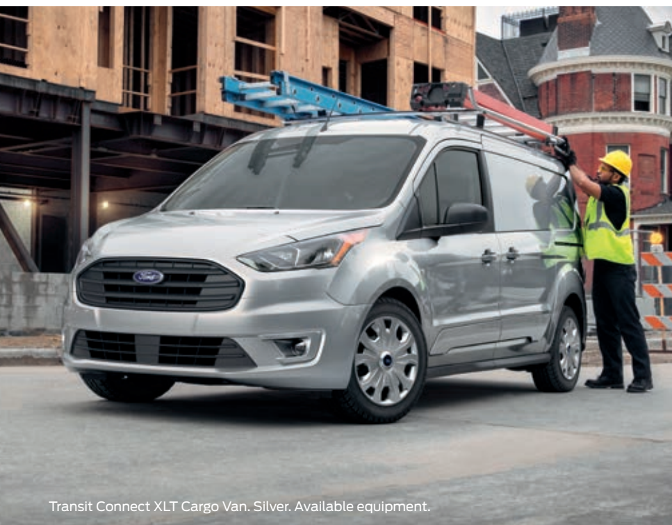
Transit Connect XLT Cargo Van. Silver. Available equipment.